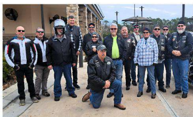
Chapter 702 – Pop Up Ride

Dest was: The Deland Stockyard, 1915 Old New York Ave, DeLand, FL 32720